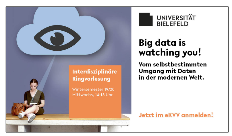
Figure 1 - Promotion for the data literacy lecture 'Big data is watching you!'

One part of the module will be the interdisciplinary lecture entitled 'Big Data is watching you! How to deal with data in the modern world.' Students will be given an overview about the role of data in science, economy and society, about data analysis and the transformation of data into knowledge. Participants of the lecture can individually choose from a variety of connecting courses that are offered by different faculties to expand on