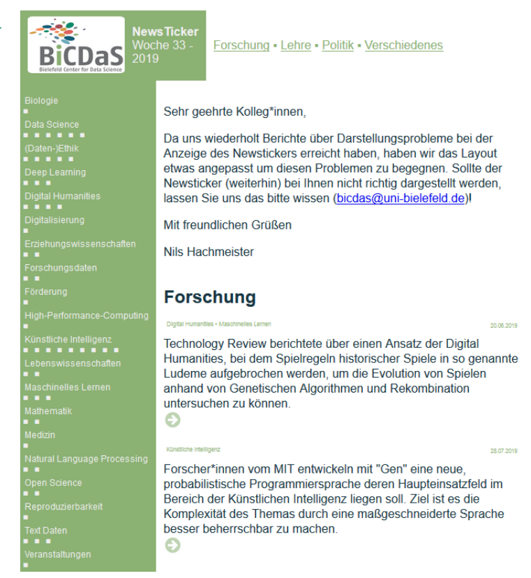
Figure 2-An example for the BiCDaS news ticker.

With the support of the rectorate, an existing funding for the modernisation of the physics GPU cluster could be extended. The new cluster became operational in May 2019, and a part of its computing capacity is now for general access by researchers from Bielefeld University. BiCDaS has accompanied this process and we are currently considering the formation of an interest group on GPU computing